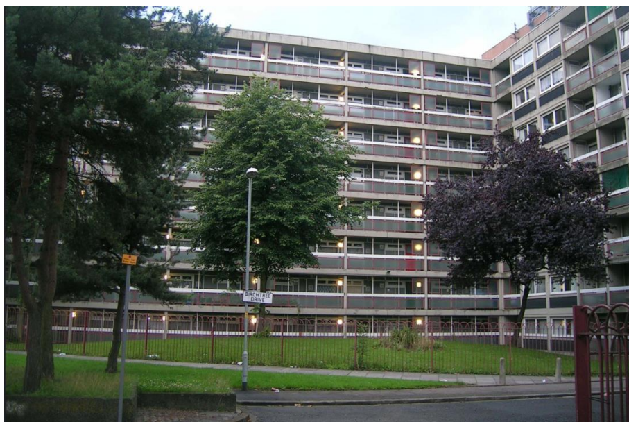
Photograph above from Flickr downloaded 6/2/24- before balustrading work

in 2007, Willow Park Housing Trust undertook some balustrade renewal work with Agent and architect 'Pozzoni LLP' and replaced the old Georgian wired glazed panels set in a timber frame with new polycarbonate panels fixed into new stainless-steel polyester power coated frames and handrails. There were some concrete repairs undertaken and all concrete cleaned.