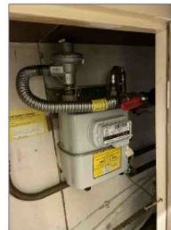
GAS METERS & ISOLATION POINT