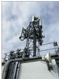
TELECOMS ARE ROOF MOUNTED ON PLANT ROOM