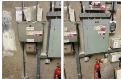
MAINS & LIFT ISOLATORS WITHIN ROOM MOUNTED PLANT ROOM